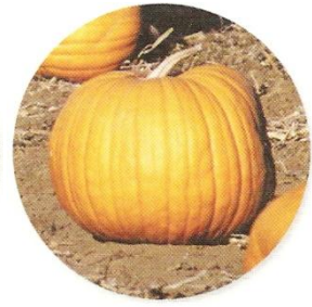
plant with fruit